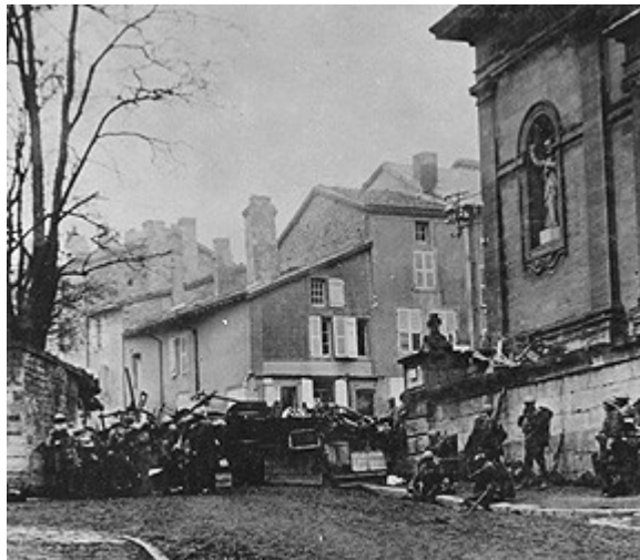
Soldiers of the 353rd Infantry near a church at Stenay, Meuse in France, wait for the end of hostilities. This photo was taken at 10:58 a.m., on November 11, 1918, two minutes before the armistice ending World War I went into effect

World War I – known at the time as “The Great War” - officially ended when the Treaty of Versailles was signed on June 28, 1919, in the Palace of Versailles outside the town of Versailles, France. However, fighting ceased seven months earlier when an armistice, or temporary cessation of hostilities, between the Allied nations and Germany went into effect on the eleventh hour of the eleventh day of the eleventh month. For that reason, November 11, 1918, is generally regarded as the end of “the war to end all wars.”